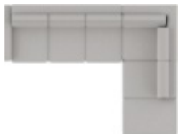
12/35 112 x 80" 285 x 204 cm