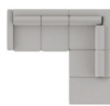
07/35 90 x 80" 229 x 204 cm