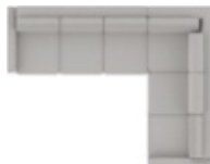
12/40 112 x 88" 285 x 224 cm