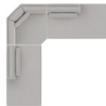
20/9W/19 117 x 117" 298 x 298 cm