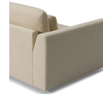
SINGLE NEEDLE TOP STITCHING