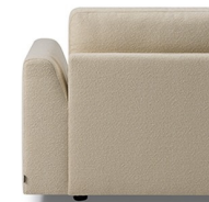
ENGINEERED WOOD FRAME