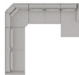
A2/9W/90/15 147 x 140" 374 x 356 cm