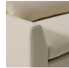
LOOSE SEAT CUSHIONS