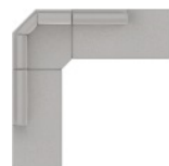
20/9W/19 112 x 112" 285 x 285 cm