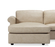
DOUBLE NEEDLE TOP STITCHING