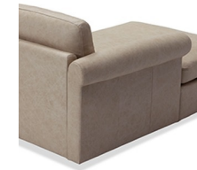
ENGINEERED WOOD FRAME