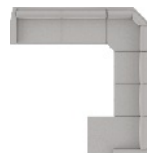
A2/9W/90/15 135 x 142" 343 x 361 cm