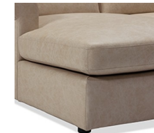
ESPRESSO WOOD LEG