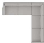
B2/9B/B3 111 x 111" 282 x 282 cm