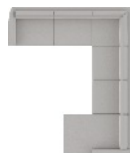
B4/90/15 111 x 135" 282 x 343 cm